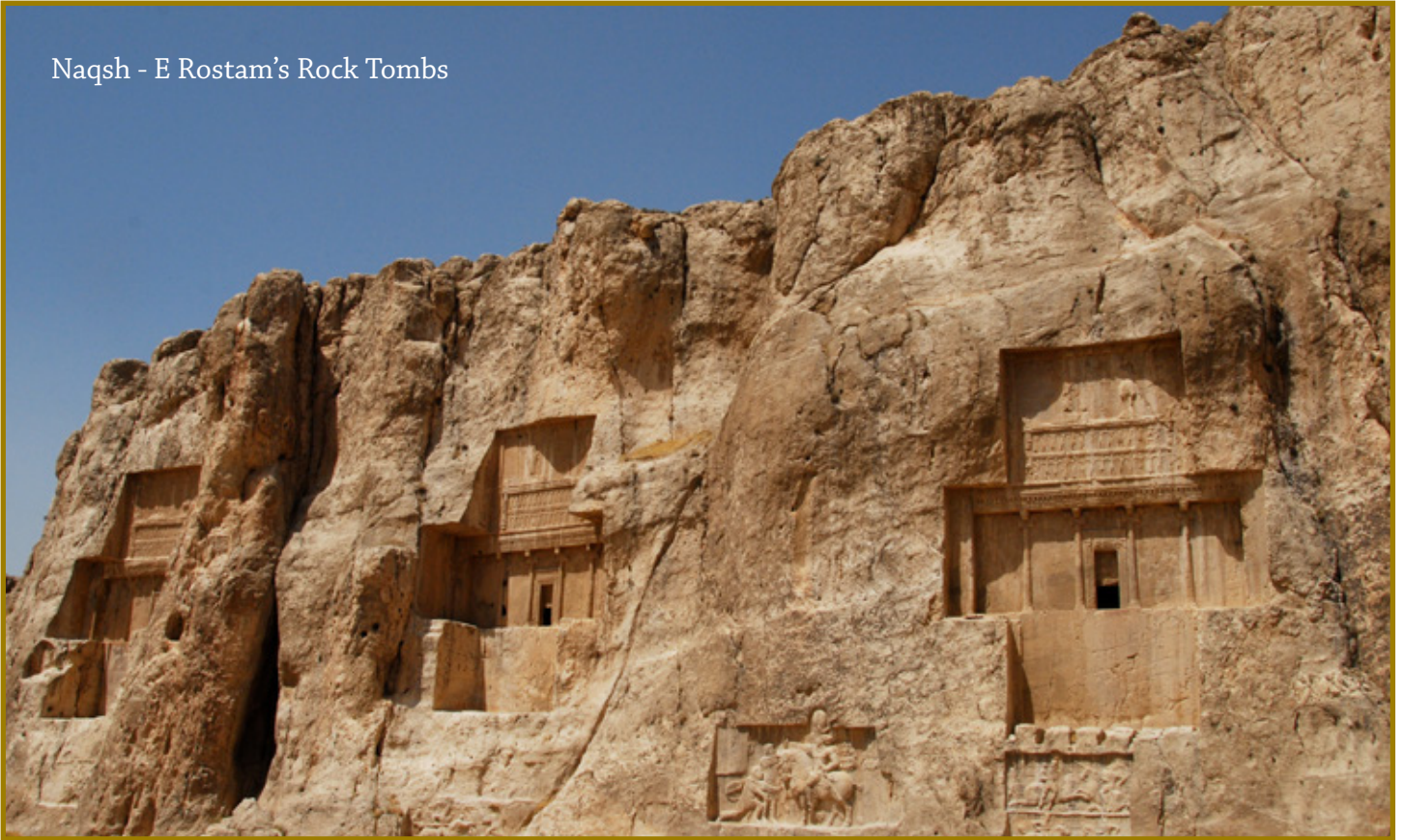
Naqsh - E Rostam's Rock Tombs