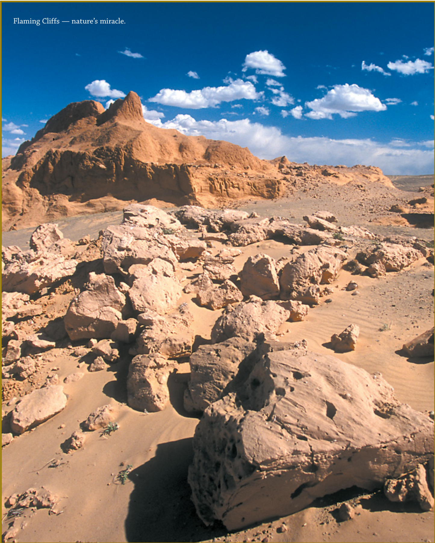
Flaming Cliffs — nature's miracle.