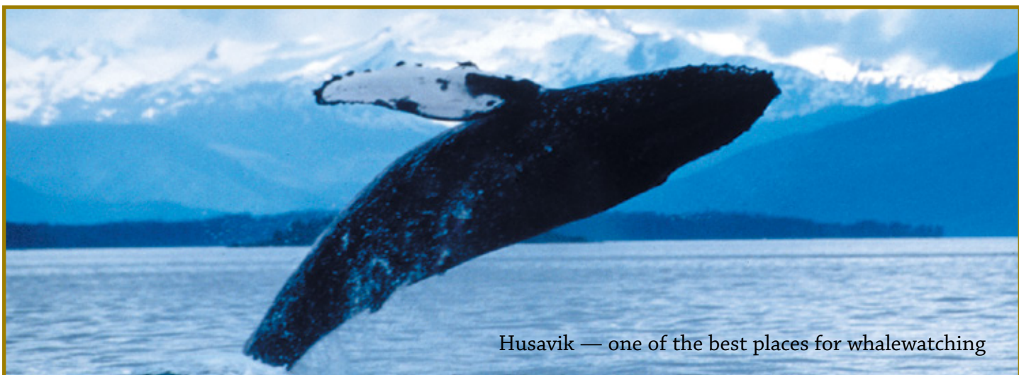
Husavik — one of the best places for whalewatching

surrounding mountains. We will also make a stop at Perlan, Hallgrímskirkja church and Harpa Music Hall. During the city tour we enjoy lunch at a local restaurant. Late afternoon will be free to spend at own leisure, until dinner.