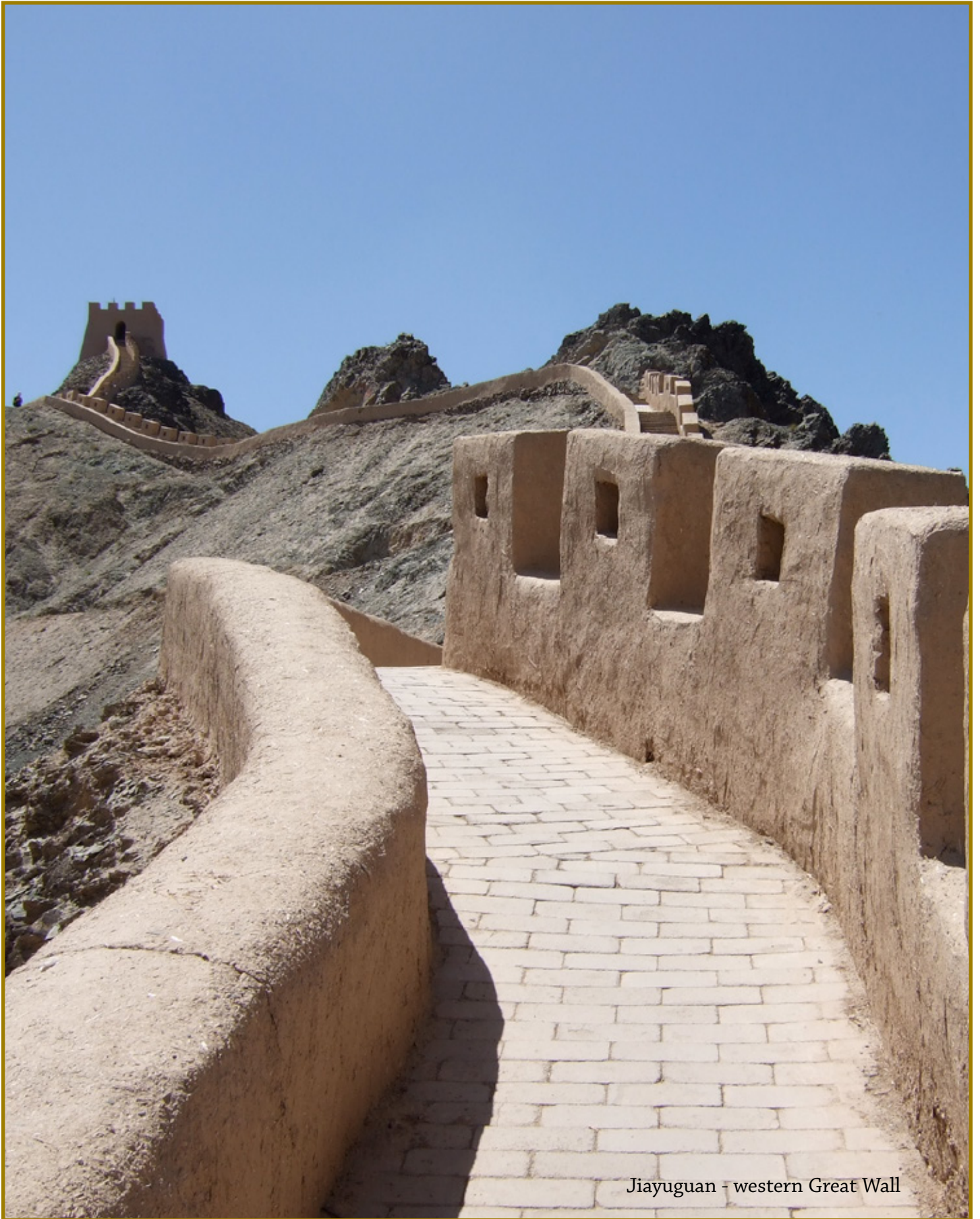
Jiayuguan - western Great Wall