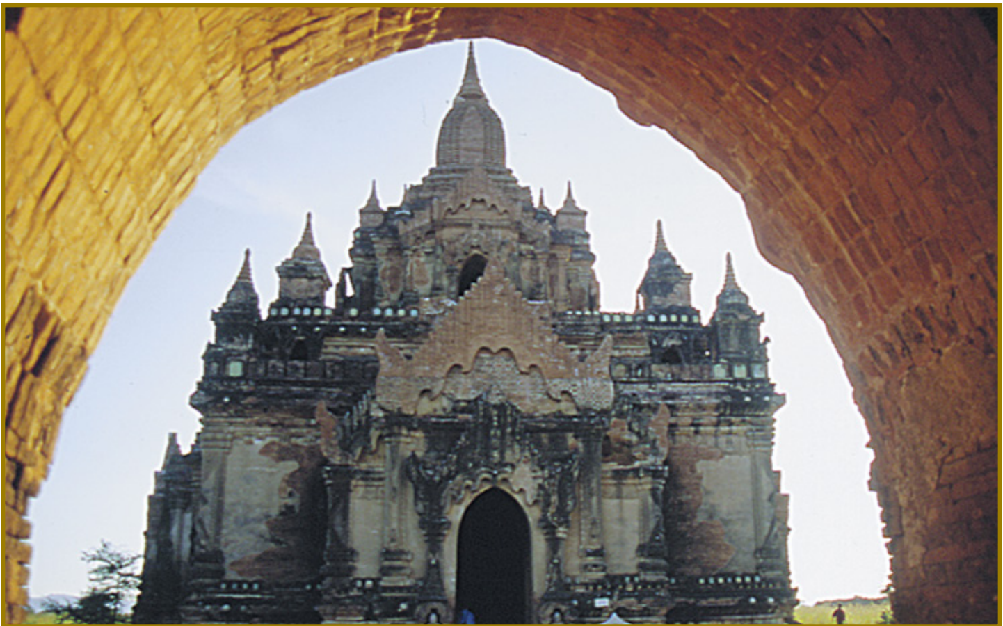
Ancient temples of Pagan