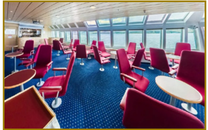
Panorama Lounge aboard the Ocean Nova

Thanks to the Ocean Nova’s intimate group size and our seamless operations, hopping into one of our eight Zodiacs is a breeze—rain, shine, or snow. With the ship’s shallow draft and ability to anchor close to shore, you’ll spend less time ferrying and more time exploring. Need to head back to the ship mid-excursion? No problem. Simply return to the landing site, and we’ll whisk you back in no time. More adventure, less waiting—that’s the Ocean Nova way!