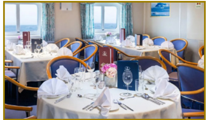
Dining aboard the Ocean Nova.