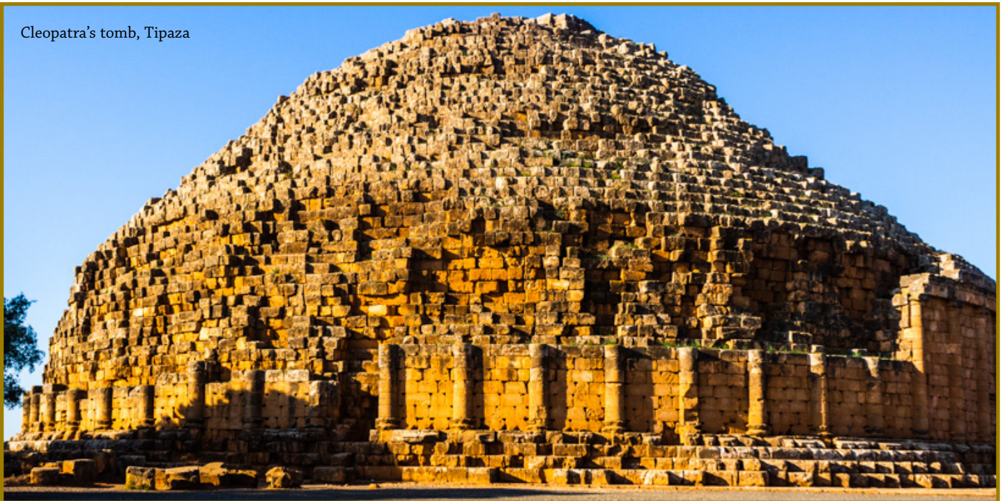
Cleopatra's tomb, Tipaza