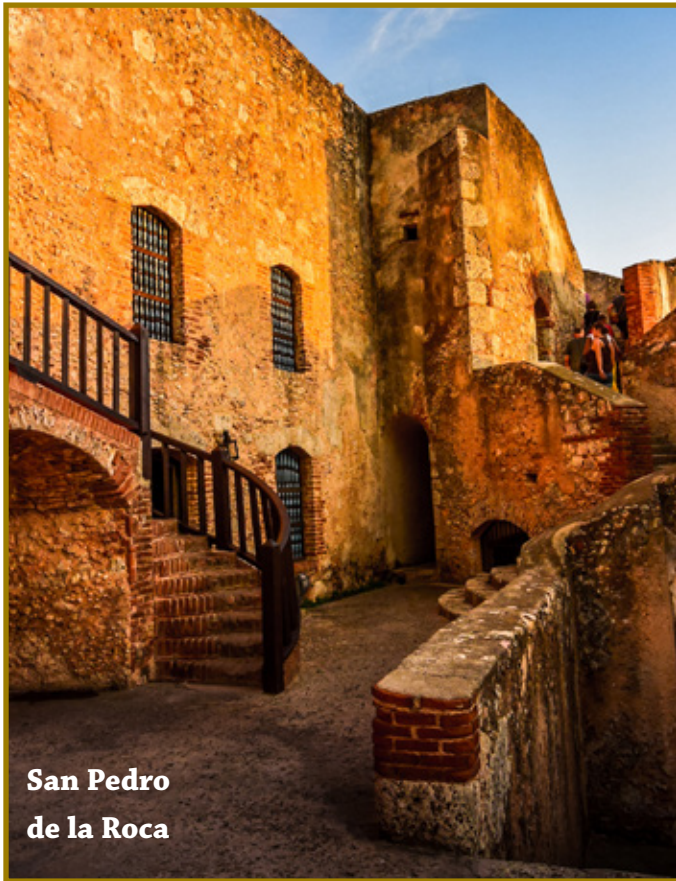
San Pedro de la Roca