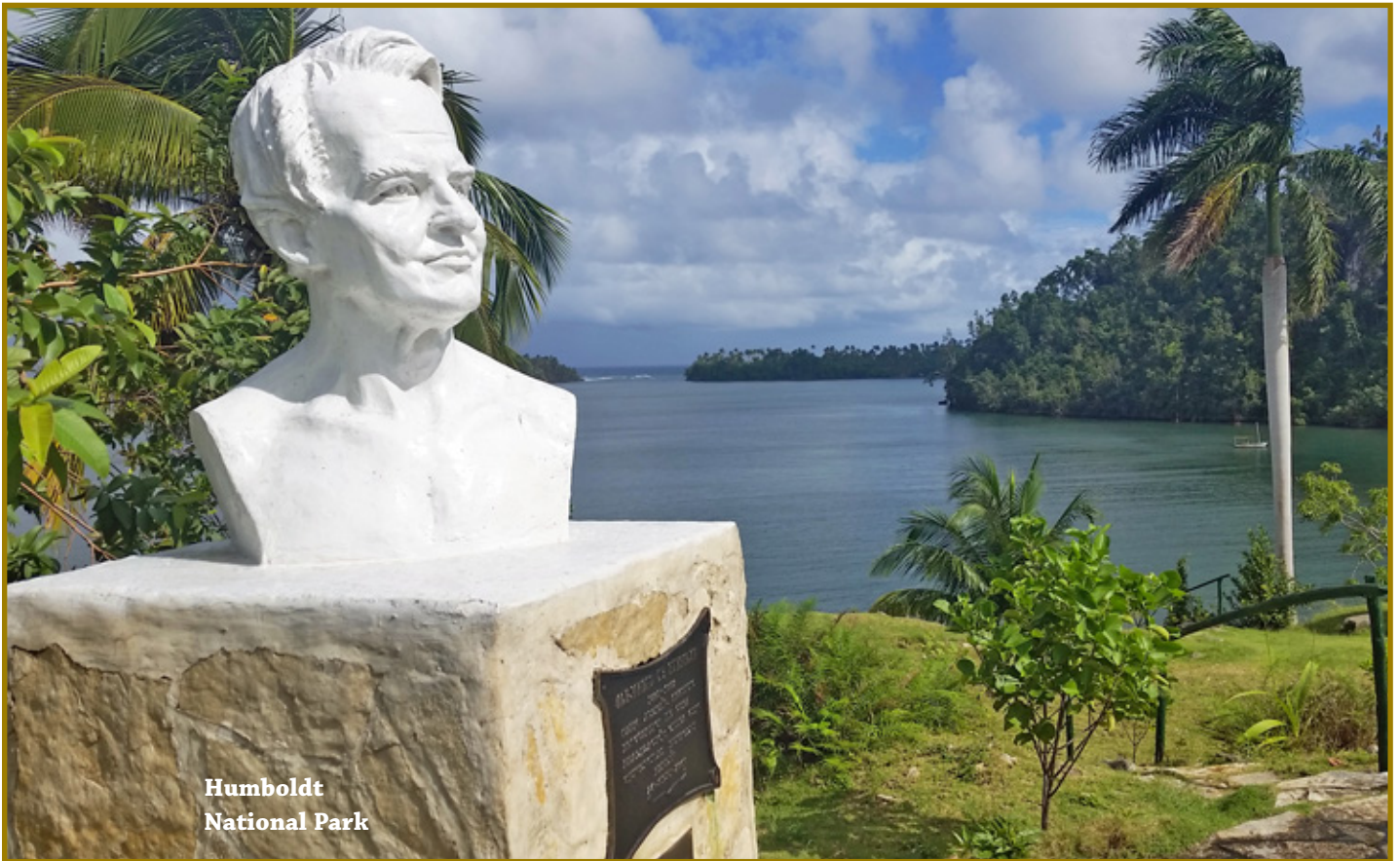
Humboldt National Park