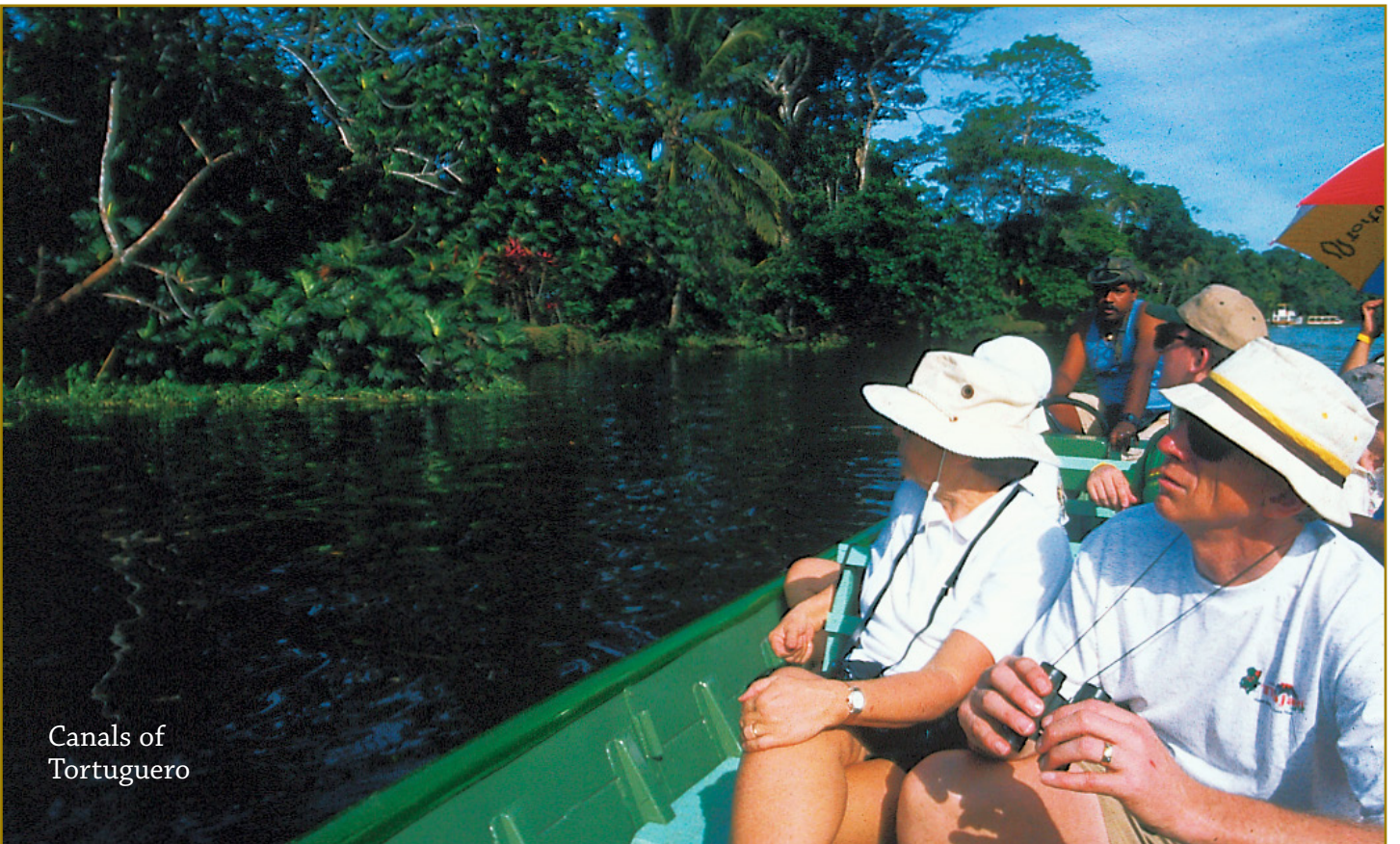
Canals of Tortuguero