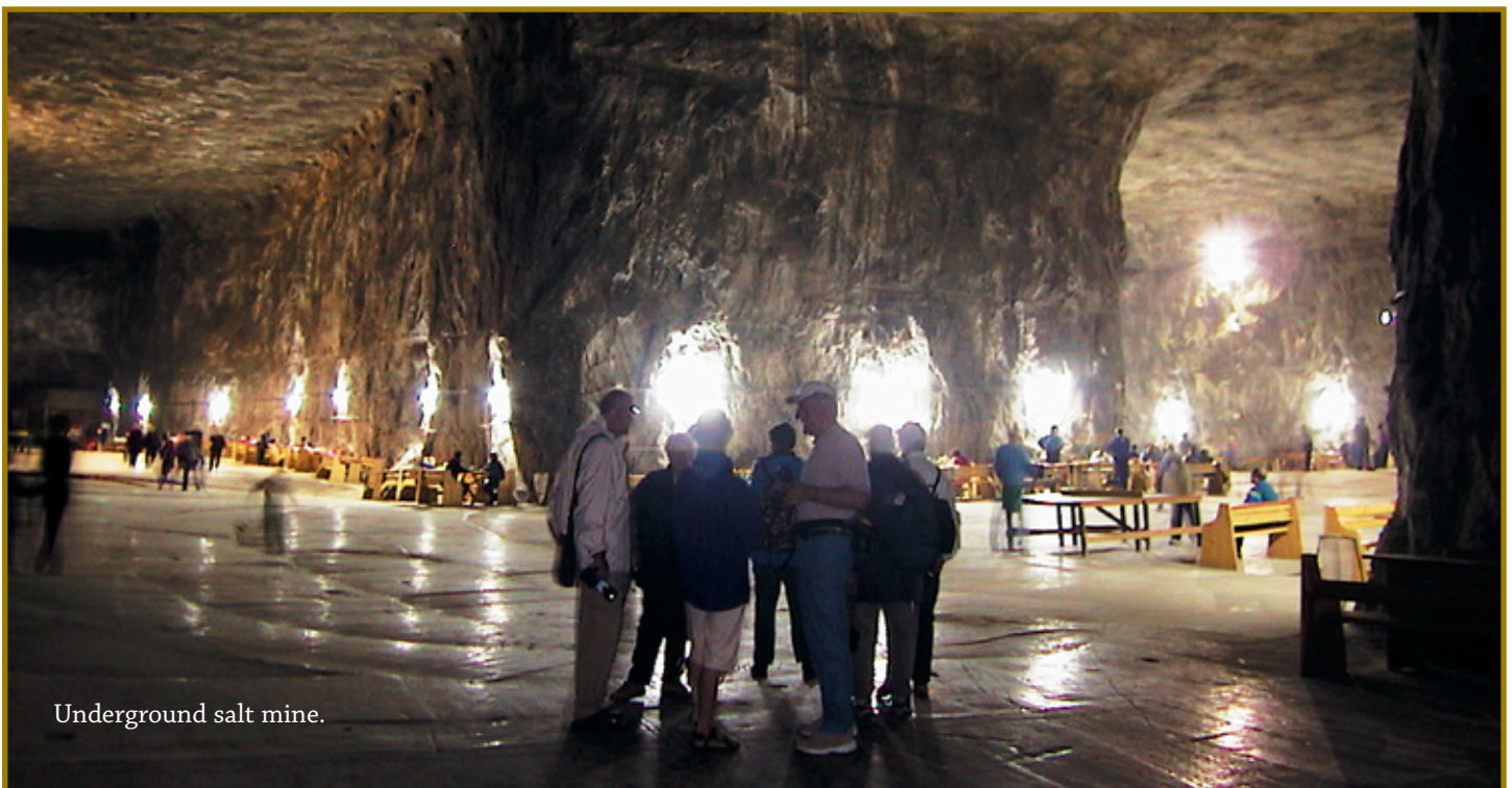
Underground salt mine.

Afterwards we continue with a visit to the Salt Mine at Praid. Traveling by bus, we descend down into the mine far below the surface. Today the salt mine is a sanatorium for children who suffer from asthma. They come here to live and sleep for several weeks while they receive care for their