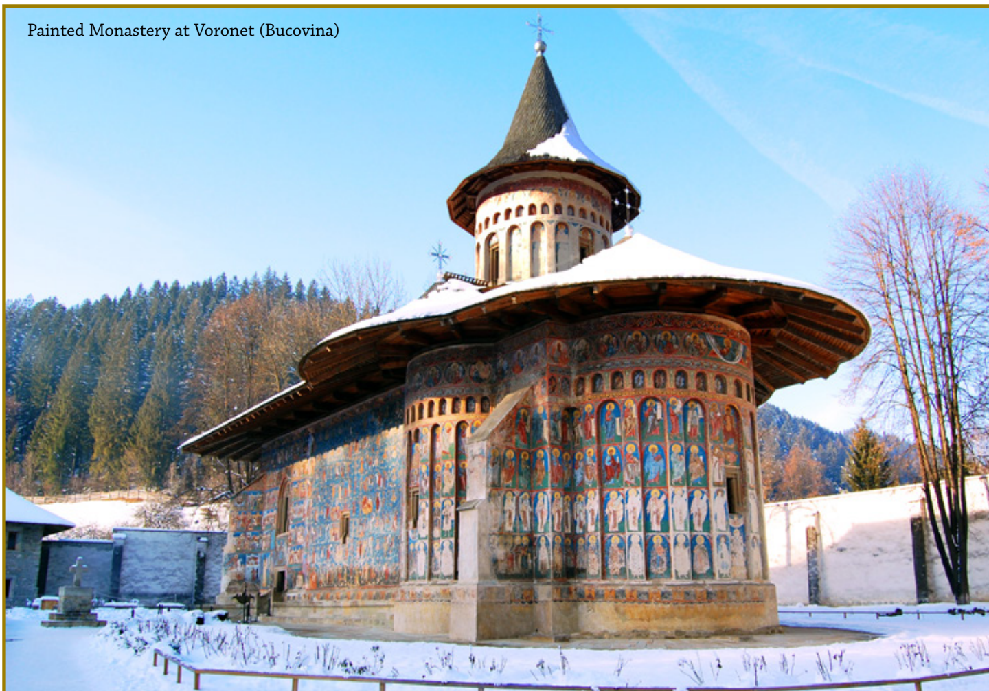
Painted Monastery at Voronet (Bucovina)

The broad Danube River runs through the middle of this stunning metropolis, dividing hilly Buda