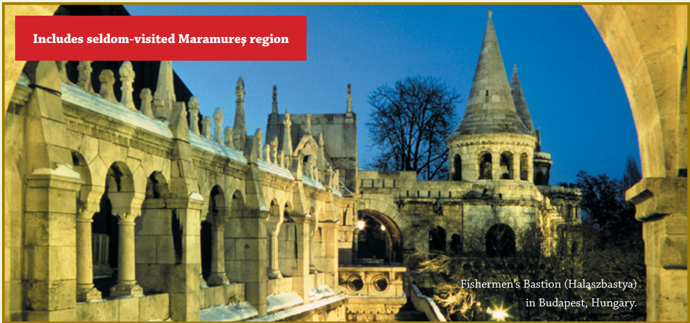
Fishermen's Bastion (Halászbastya) in Budapest, Hungary.

Includes seldom-visited Maramureş region