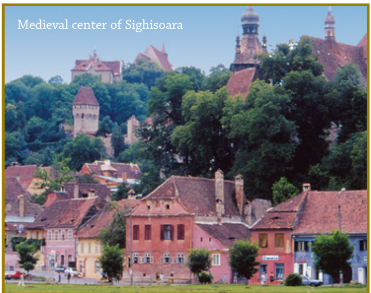
Medieval center of Sighisoara