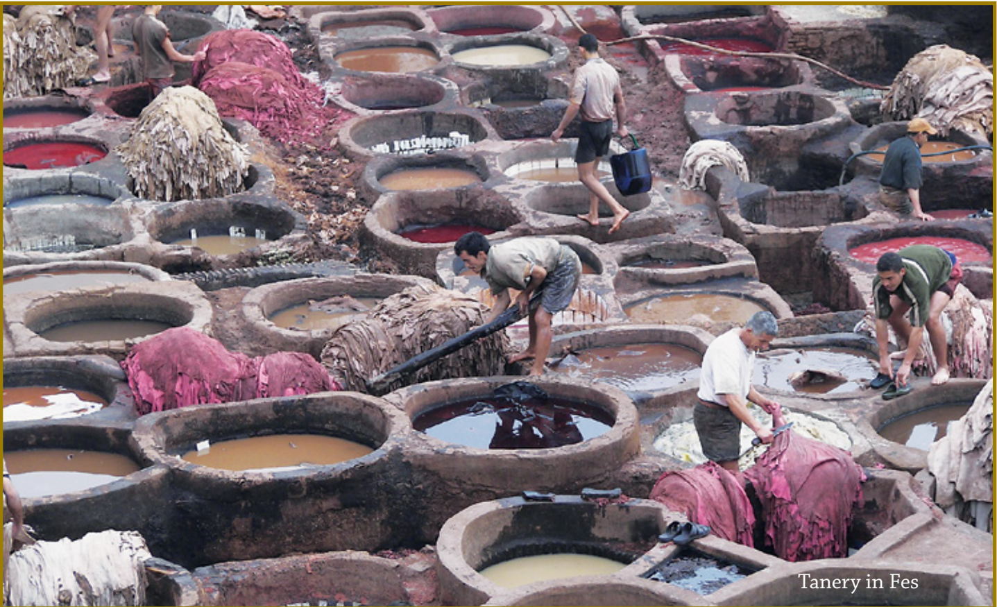
Tannery in Fes