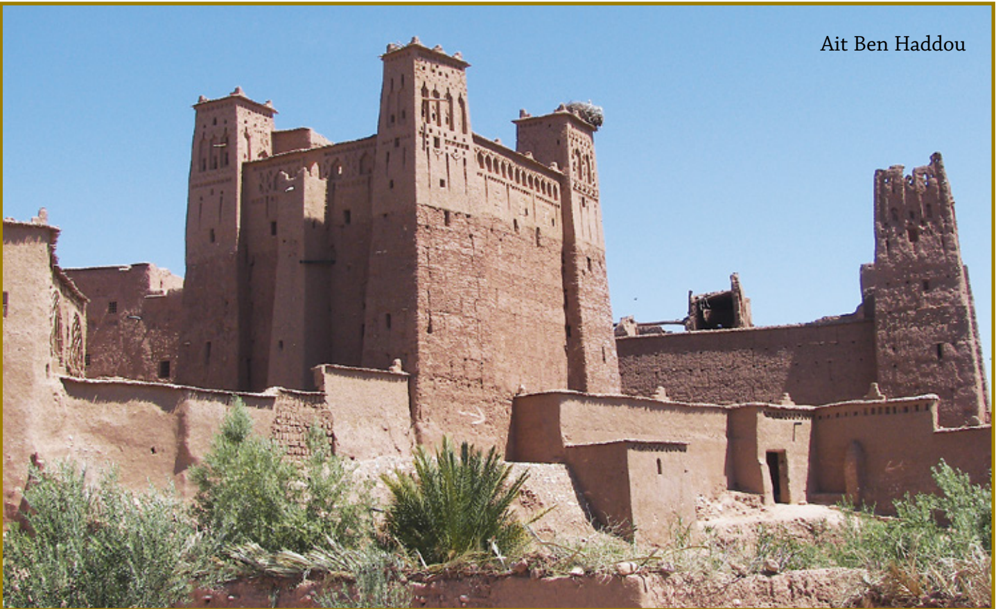
Ait Ben Haddou