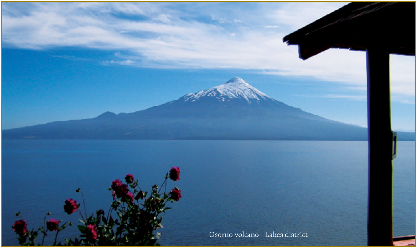
Osorno volcano - Lakes district

After lunch we drive to the Petrohué Rapids in the Petrohué River that drains the All Saints Lake. We will have time for one or two short strolls and enjoy unbelievable views of the rapids with the Osorno in the background and the forested mountains around. After our visit, we will drive back to Puerto Varas. Time permitting, you may be able to visit the town on your own.