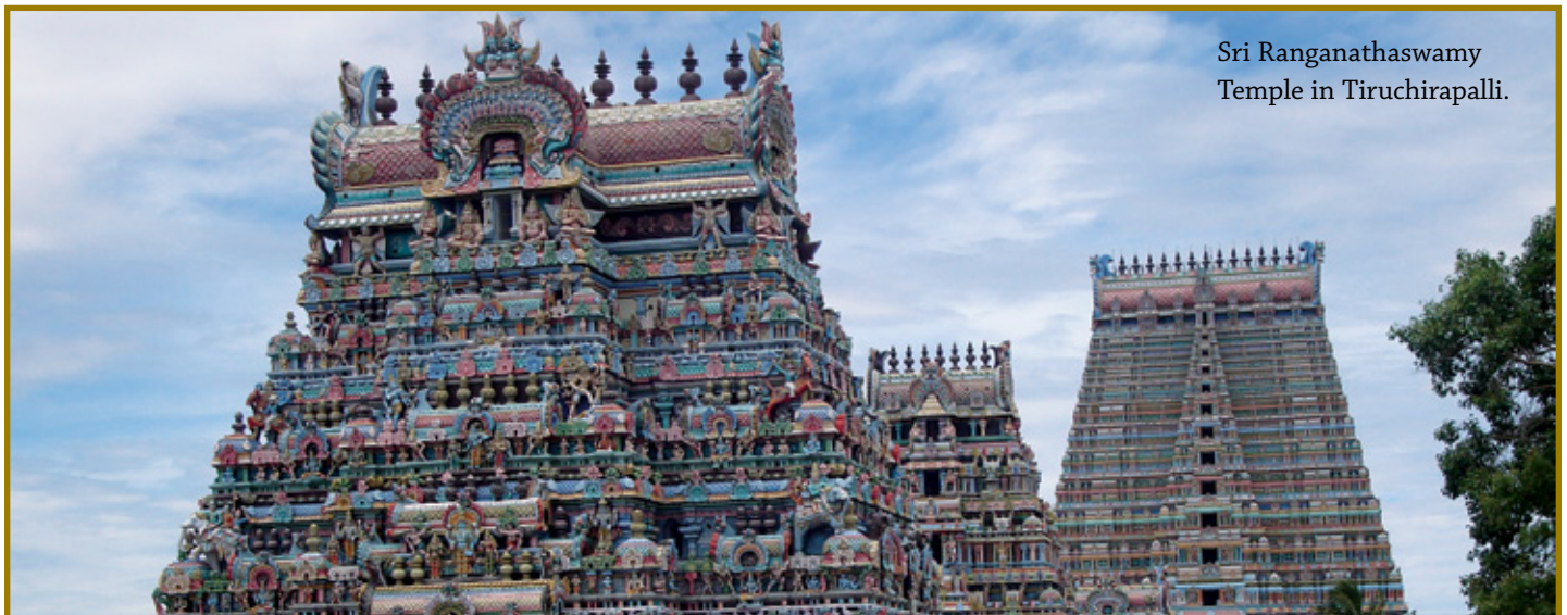
Sri Ranganathaswamy Temple in Tiruchirapalli.

After breakfast we check out and drive (approx 4.5 hours) to Madurai, known as ‘the city of temples’ due to its countless ancient Hindu shrines. Enroute we will stop at Brihadeeshwara Temple. The massive temple built by Rajaraja Chola reflects the Cholas’ contribution to the development of arts in this area. It is also regarded as the Chola dynasty’s finest