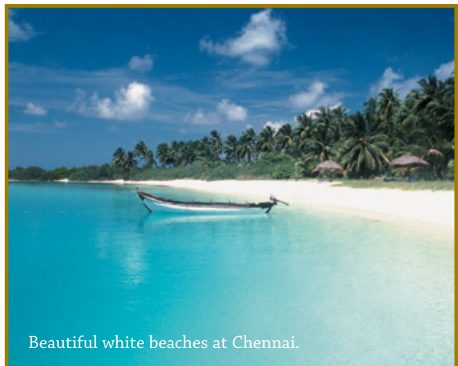
Beautiful white beaches at Chennai.