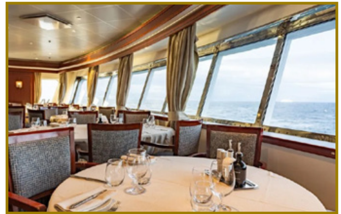
Explorers Table Grand Restaurant aboard the Exploris One.