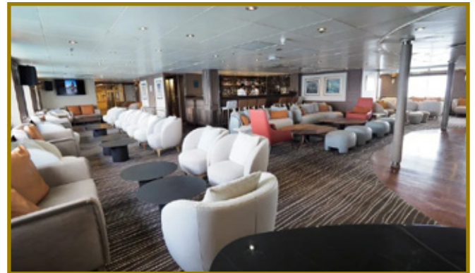
Main lounge aboard the Exploris One.