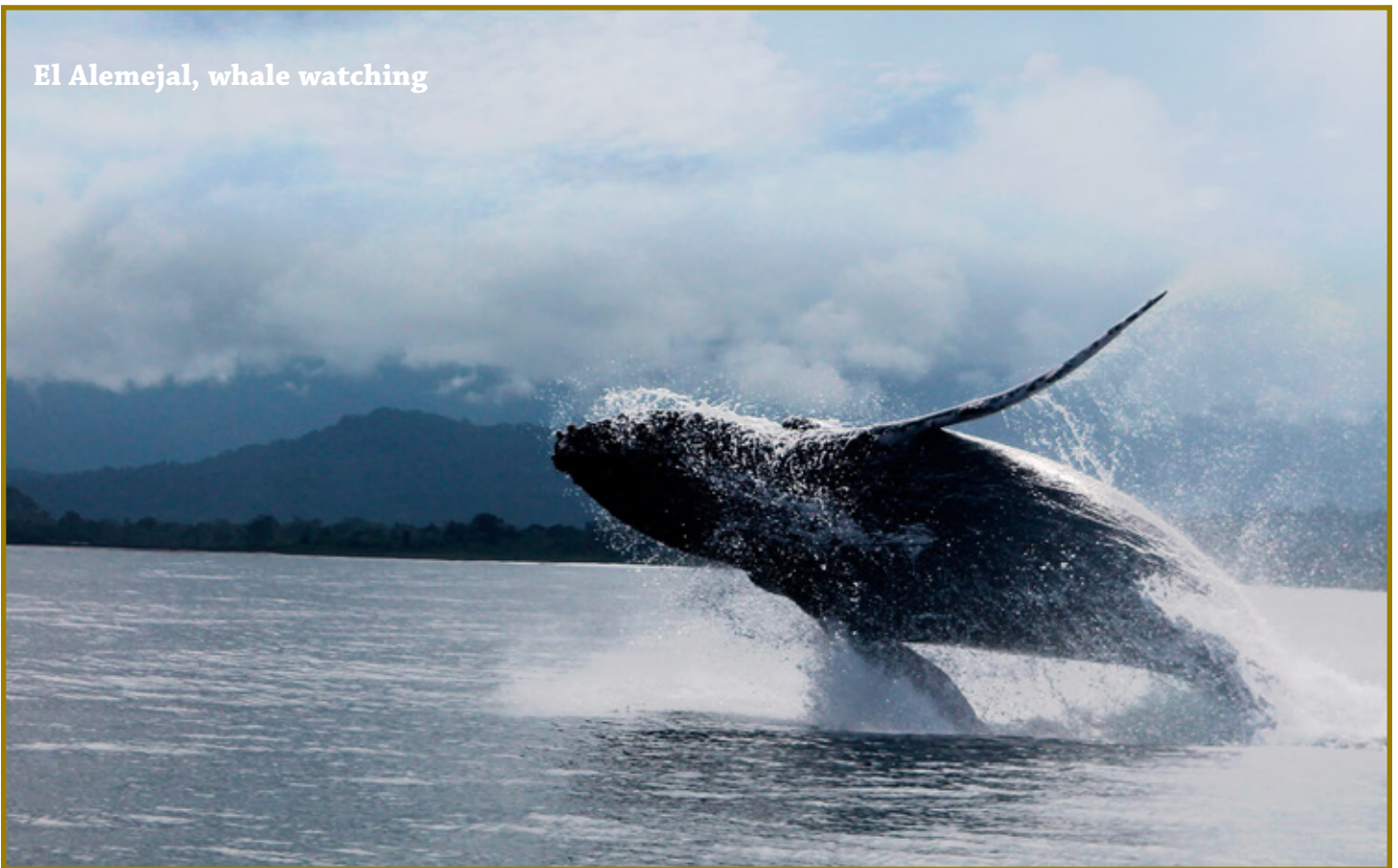
El Almejal, whale watching