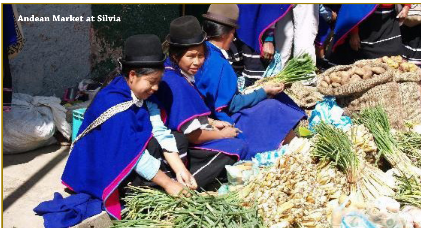
Andean Market at Silvia

Immersing ourselves in the hustle and bustle of downtown Medellín we reach Botero Plaza, a park dedicated to Fernando Botero, Colombia's most famous sculpturer and painter. The exhibition of a number of his proportionally exaggerated sculptures has become a popular landmark of the city. We take the modern Metro Cable up to Santo Domingo, once a notorious area of gang violence in Medellín. The cable car was constructed to make the inner city more