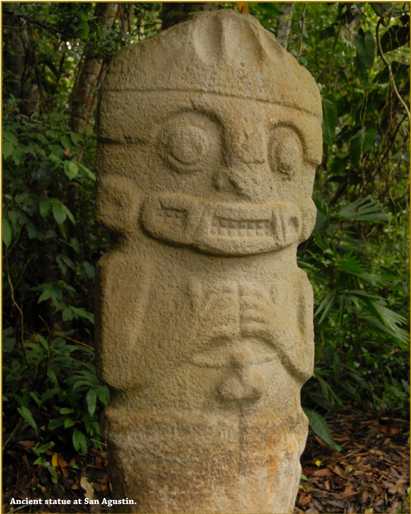
Ancient statue at San Agustin.