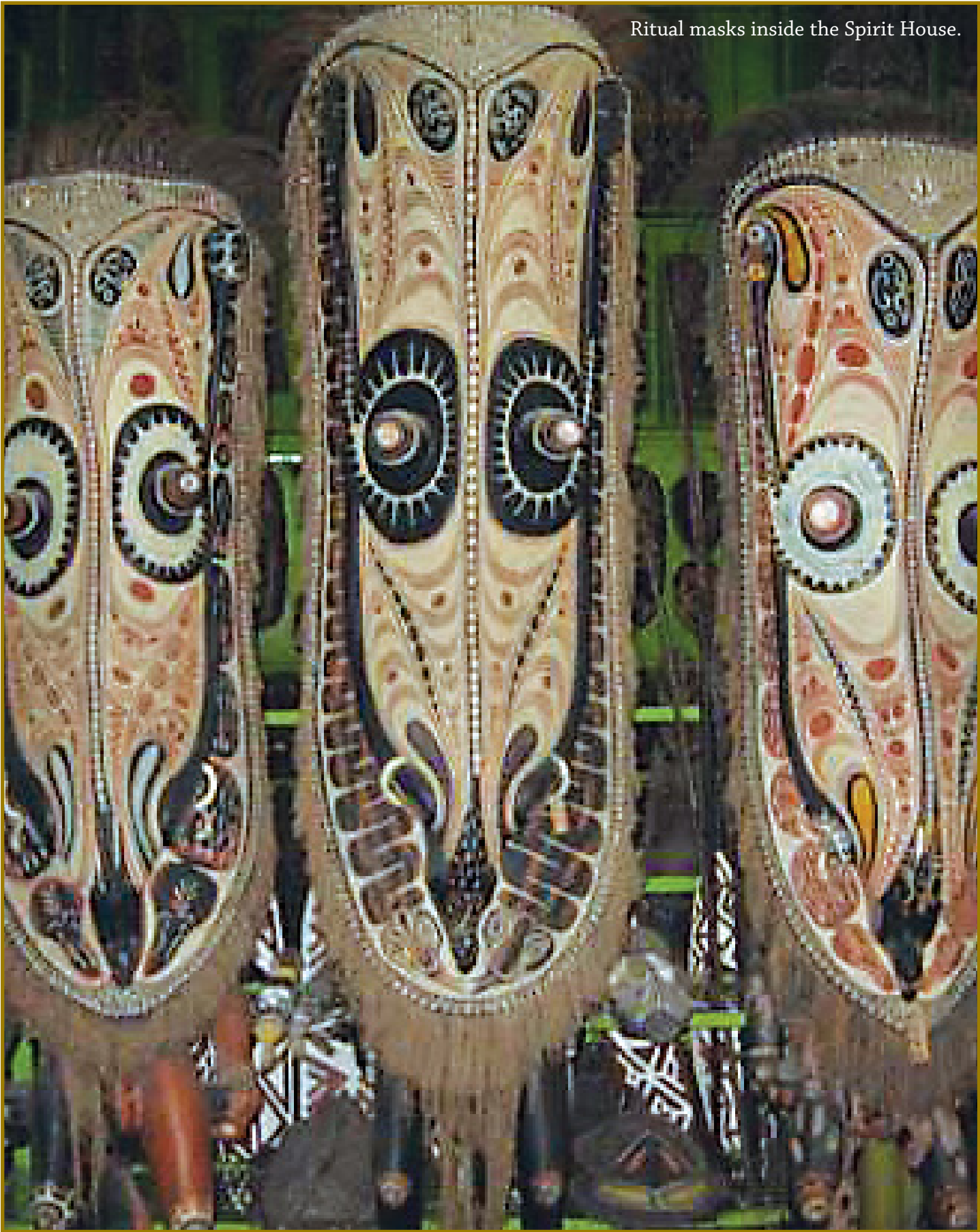
Ritual masks inside the Spirit House.