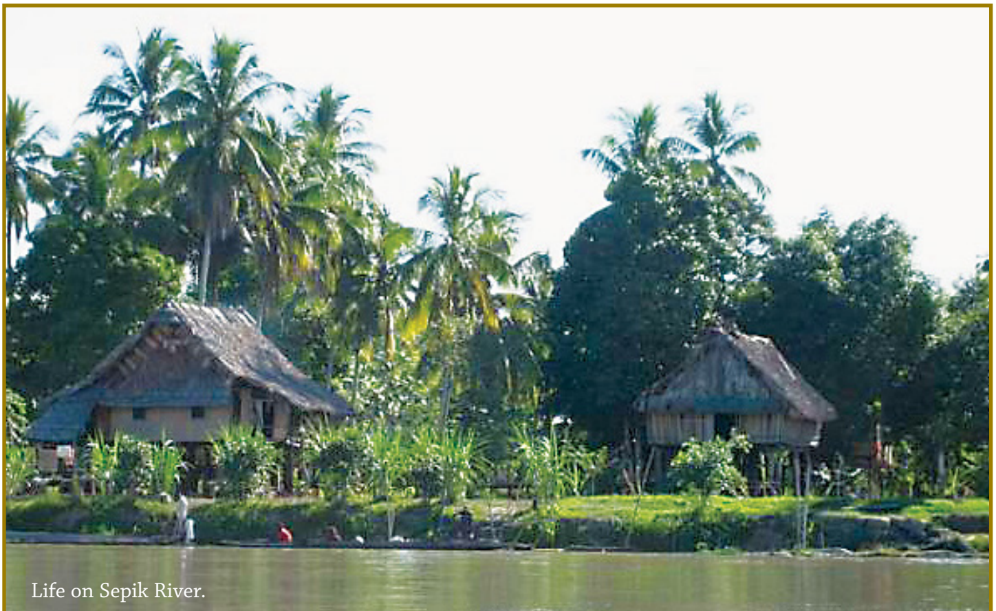
Life on Sepik River.