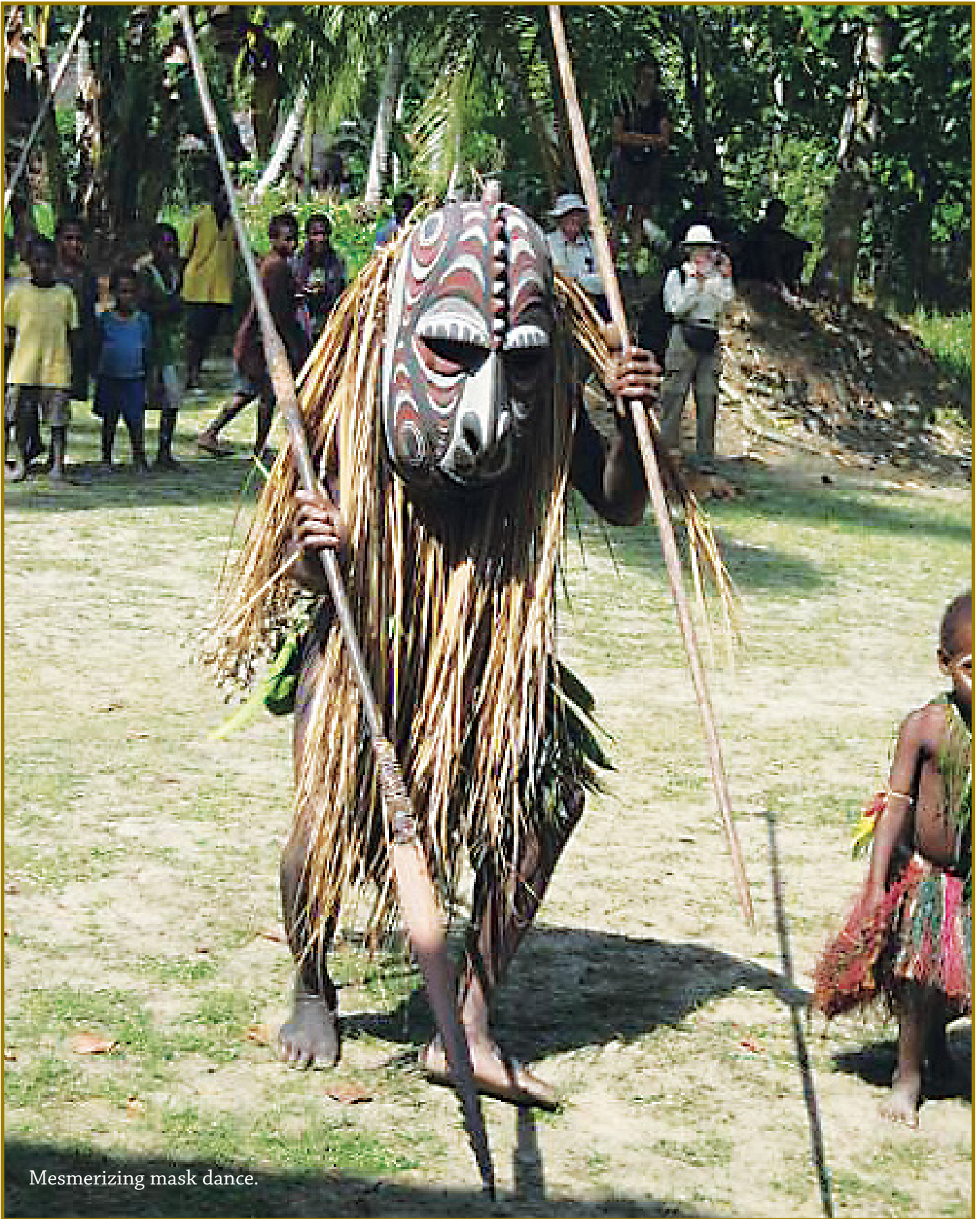
Mesmerizing mask dance.