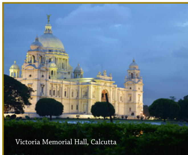
Victoria Memorial Hall, Calcutta