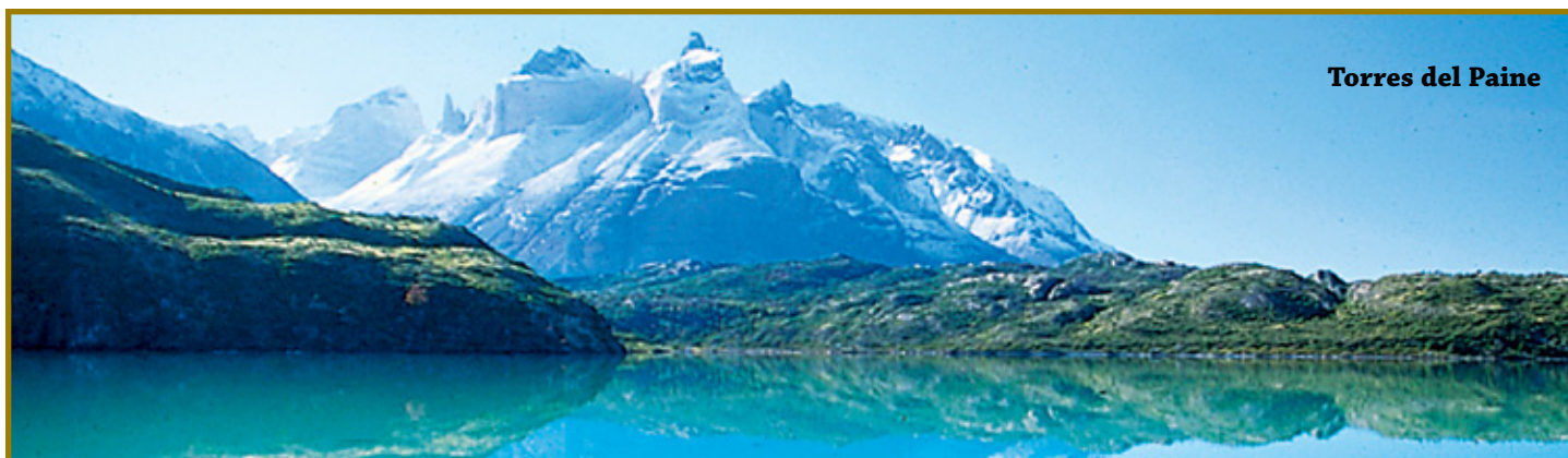
Torres del Paine