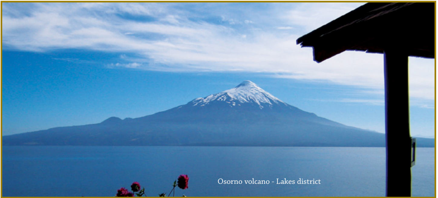
Osorno volcano - Lakes district